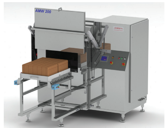
10 KW Microwave Oven