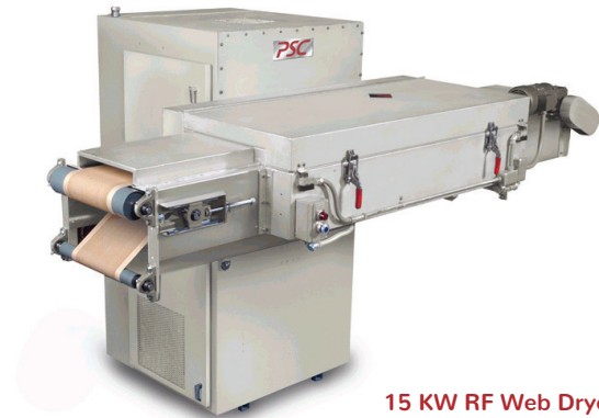
15 KW RF Web Dryer